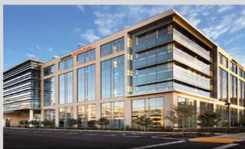
Campus @ 3333 Scott Blvd

Cerano, a 363-unit multifamily property in Milpitas, CA, sold in Q1 2023. The property was acquired as land by the Fairfield California Housing Fund in 2007. Fairfield completed construction in 2013. The property met business plan expectations for cash flow generated during the hold period and profit upon sale.