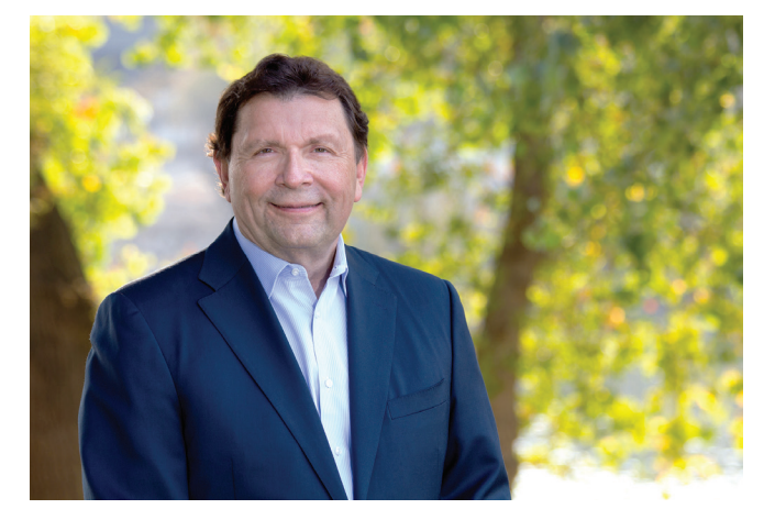
Ours is a strategic responsibility to manage, rather than react, to change.

We see opportunities on the horizon that could alter or change the way we do business. CalSTRS' strength lies in being organizationally nimble to adopt new investment strategies, adapt to digital change, respond to employer and member needs, and grow and support a 21st-century workforce that is agile and prepared for change.